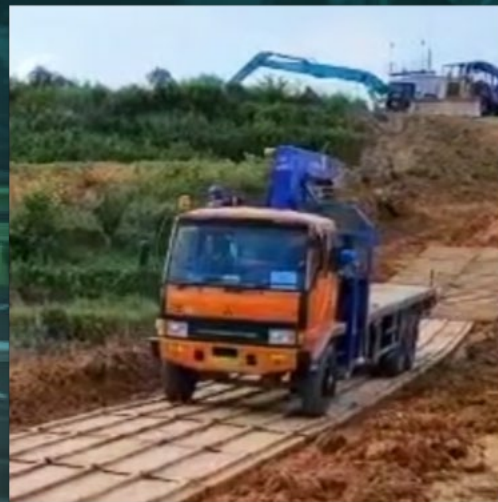
ECOMAT Pro Before & After