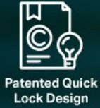
Patented Quick Lock Design

Independent HDSW Bamboo beam designed for quick connection and engineered to stay connected.