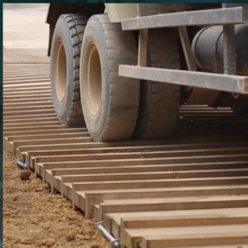
Dscaff ECOMAT Pro